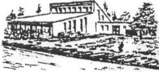
St. Wulstan & St. Thomas of Canterbury Stourport on Severn

The Holy Family Church High Street, Bewdley